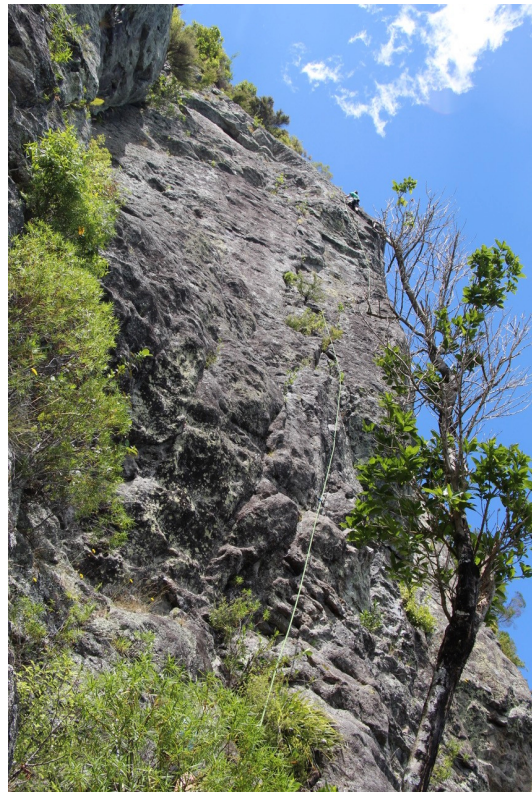
Lindsay - sending the Gecko