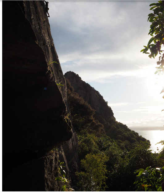
Somewhere above Kawakawa