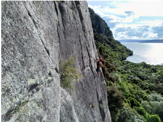
Conrad Gecko Groove