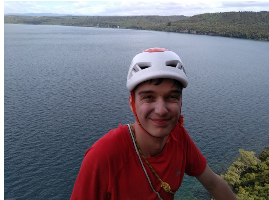
It's what we do