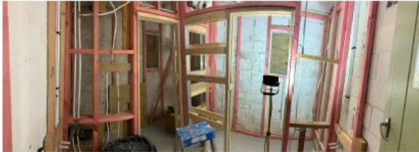
Photo 8. The new Bathroom during its construction showing the timber-framed internal walls.