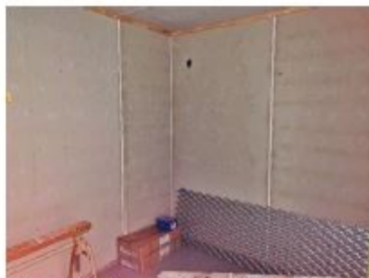
Photo 11. The new Drying Room during its construction showing the walls & ceiling lined and floor sealed