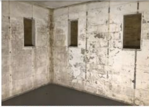
Photo 7. Originally housing the inefficient 'drying room', this was a dark and under-utilised space.