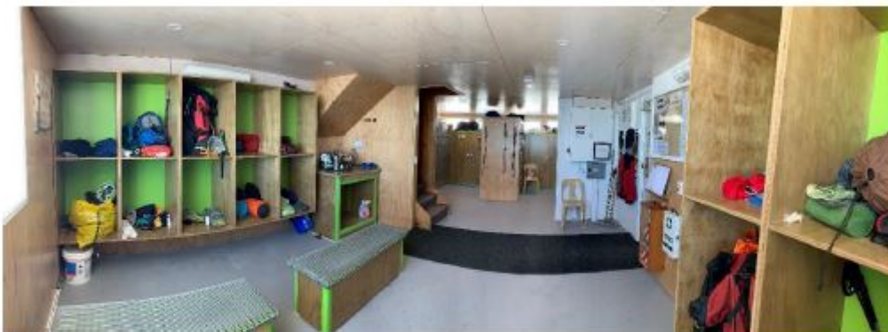
Photo 3. Taken from the same view as above photos 1 & 2 - the renovation is now complete with significant improvements to space, light, storage and future maintenance. TAC volunteers made the new made-to-measure pack racks, storage cupboards, bench seats, work bench as well as painted the floor and all plywood.