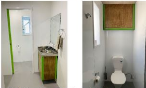
Photo 9. The new Bathroom - a bright and functional bathroom space.