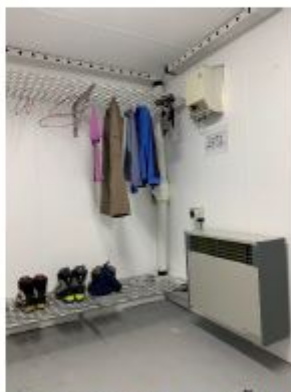
Photo 12. The new Drying Room – a bright, spacious and efficient drying space.