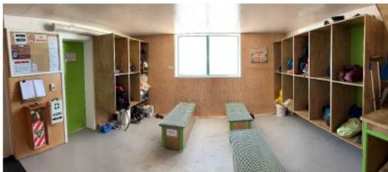
Photo 6. Taken from the same view as above photos 4 & 5 - the renovation is now complete with significant improvements to space, light, storage and future maintenance. The pack storage on the right utilises valuable space where a separate room used to be, and the floor has now been re-coated with a hard wearing paint.