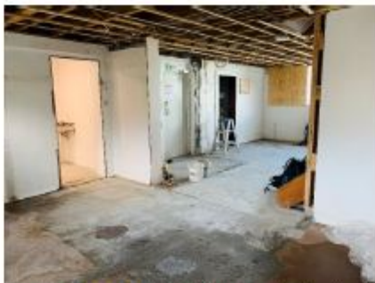
Photo 5. With demolition complete, the area was dramatically opened up to allow for the spacious new layout.