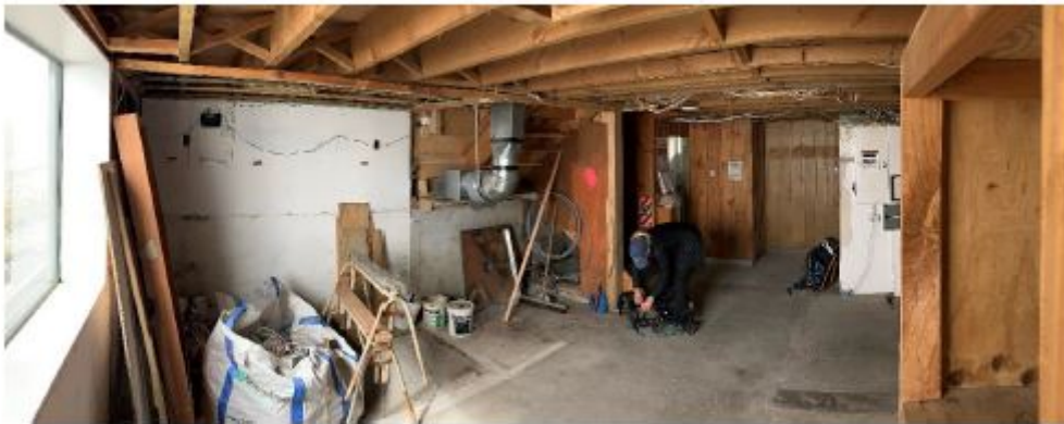
Photo 1. The Main Downstairs Area shortly into the demolition phase, with some internal walls and the ceiling panels and lights removed. The walls at the far end of the room are the 'old bathrooms', still intact.