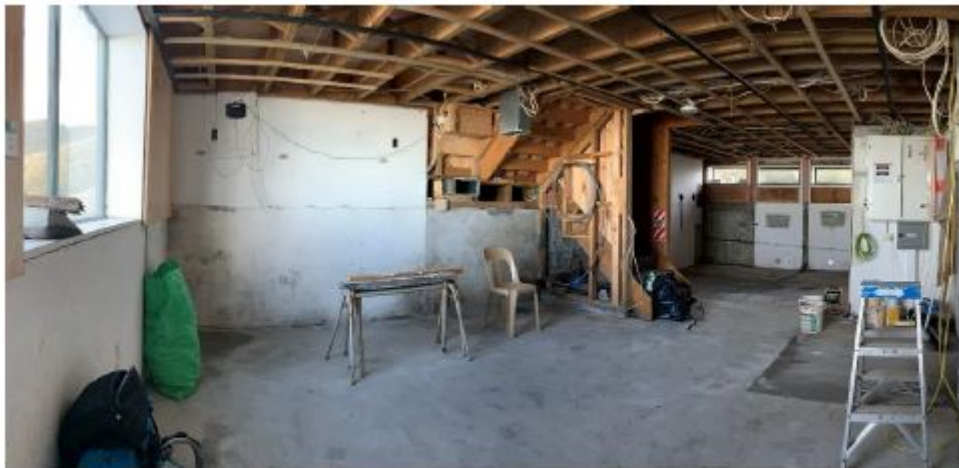
Photo 2. The Main Downstairs Area with demolition phase completed. Note that the walls at the far end of the room (the 'old bathrooms') have now also been removed, opening up and flooding additional space and light into this overall area.