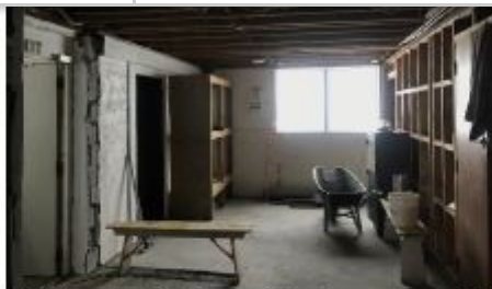
Photo 4. The Main Downstairs Area shortly into the demolition phase, with some internal walls and the ceiling panels and lights removed. The framework on the right was a wall behind which was a small separate under-utilised storage room and was about to be demolished to fully open the usable width of this space.