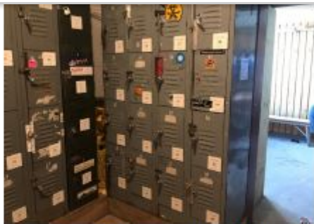
Photo 10. Originally the cramped locker room, this space was to become the new Drying Room.