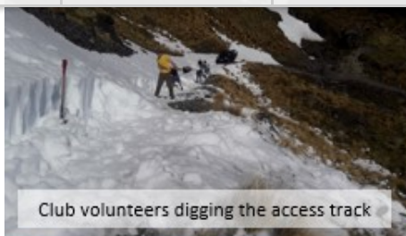
Club volunteers digging the access track