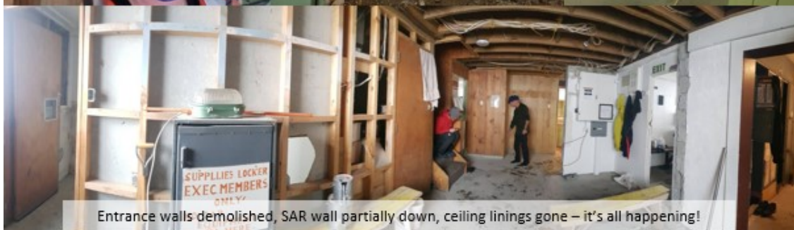
Entrance walls demolished, SAR wall partially down, ceiling linings gone – it's all happening!

For those of you who didn't empty your lockers and leave them unlocked, the project team will now do this. Club members may use the lodge during the day and/or overnight, however please bear in mind the below constraints.