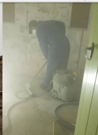
Floor grinding - a dusty job.