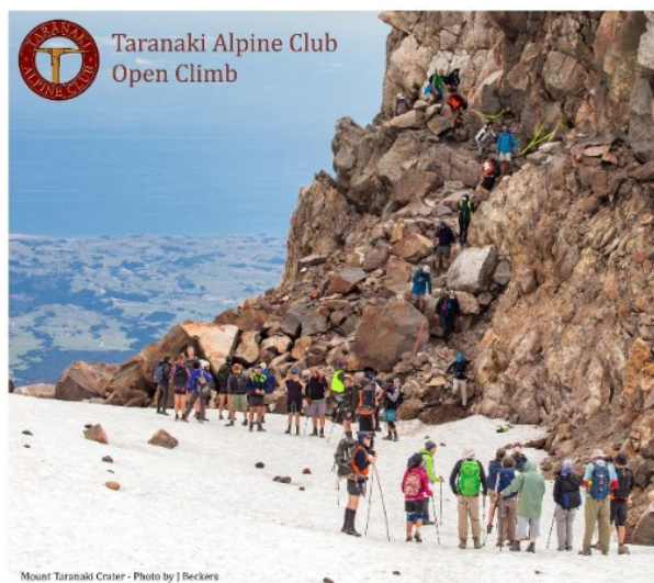
Mount Taranaki Crater

This will be followed by The Long Hope (2011) 60min. The tells the story about the first free rock ascent of the 1150 ft 'The Long Hope' route on the St Johns Head sea cliff on the Island of Hoy; the hardest climb in the UK